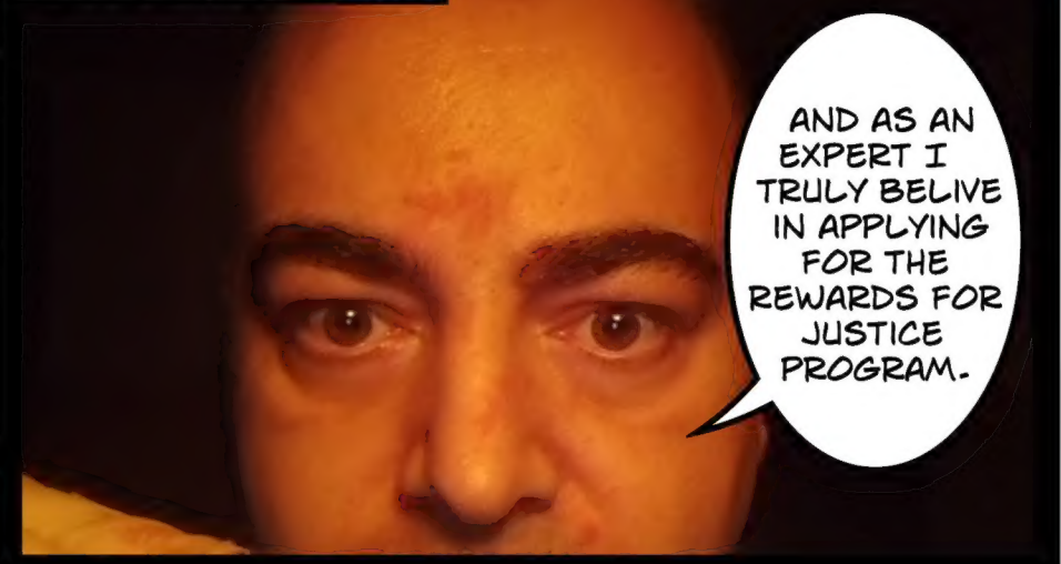
SOMEWHERE AT AN UNKNOWN LOCATION...

AND AS AN EXPERT I TRULY BELIEVE IN APPLYING FOR THE REWARDS FOR JUSTICE PROGRAM.